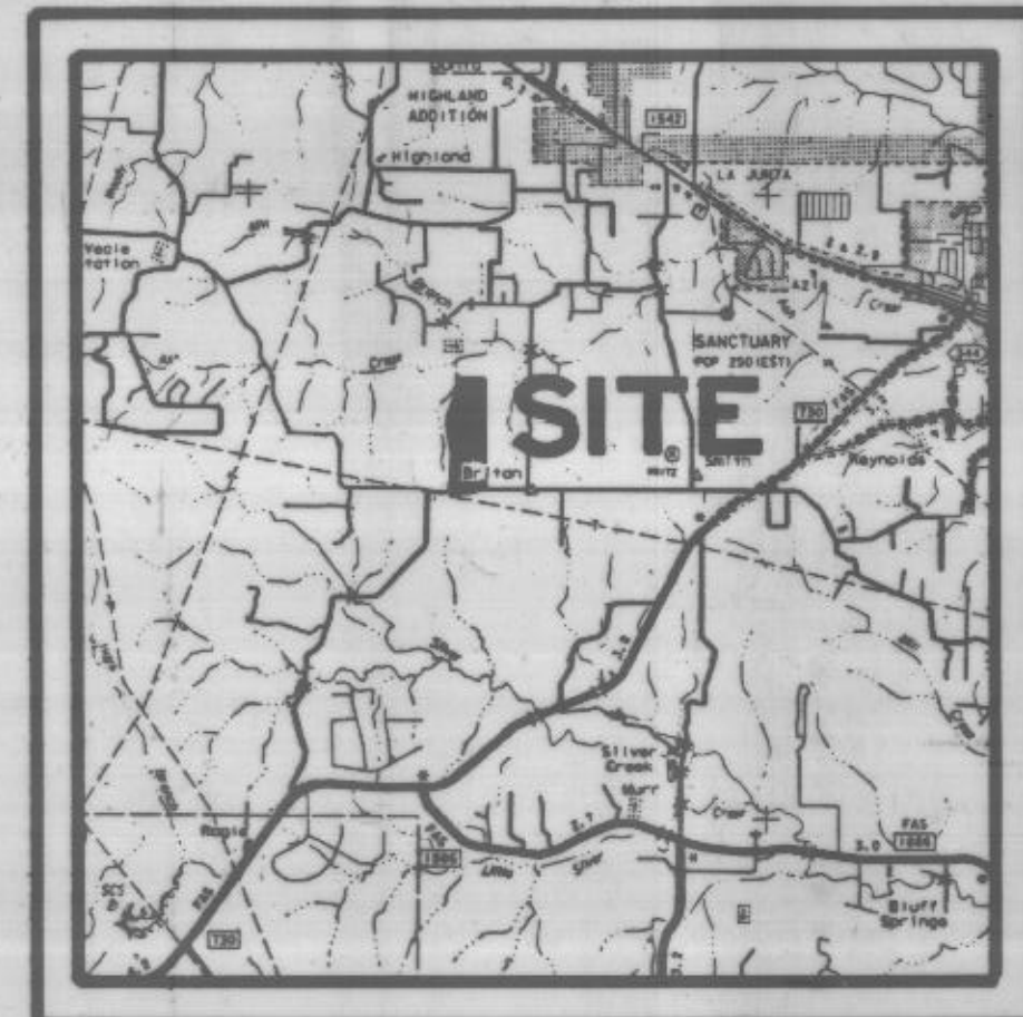
LOCATION MAP Scale 1" = 2 miles