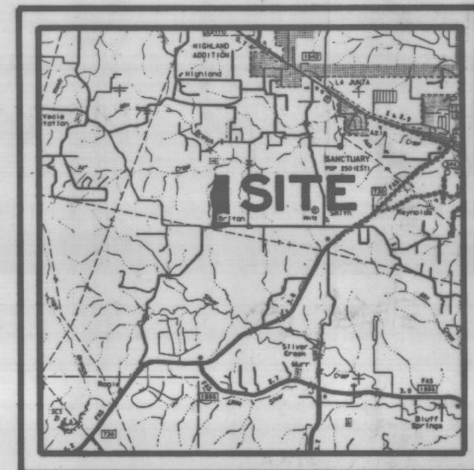
LOCATION MAP Scale 1" = 2 miles