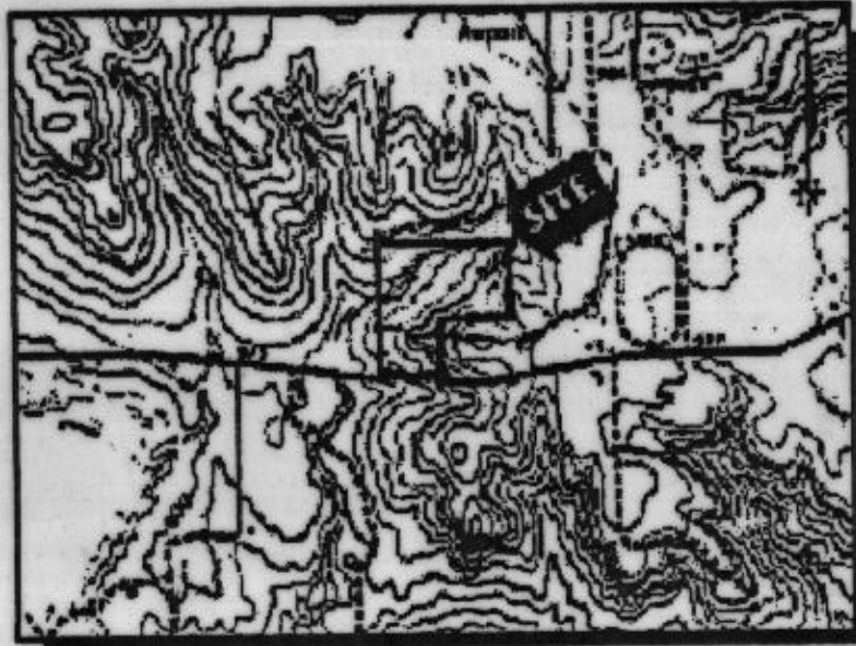
LOCATION MAP SCALE: 1"=2000'