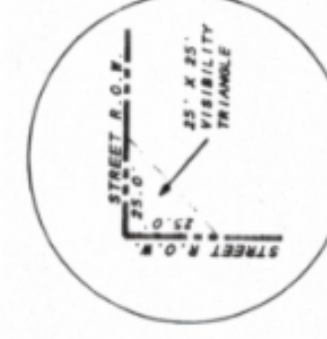
VISIBILITY TRIANGLE EASEMENT (TYPICAL ALL INTERSECTIONS)

THE RESULTS OF A WATER AVAILABILITY STUDY PERFORMED ON THIS TRACT IN ACCORDANCE WITH THE REQUIREMENTS OF PARKER COUNTY, TEXAS INDICATES ADEQUATE GROUNDWATER TO SERVE THE SUBDIVISION.